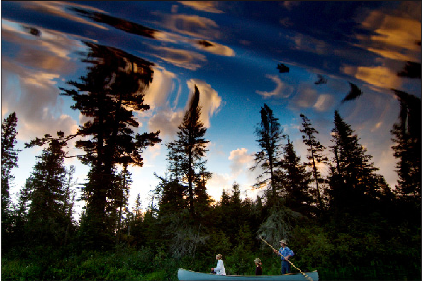
Canoeing the St. John River