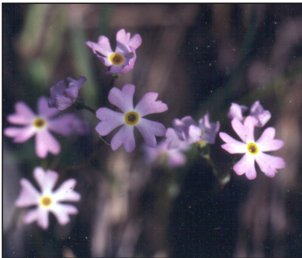
Mistassini primrose, Maine Natural Areas Program

Mistassini primrose ( Primula mistassinica ) grows along the river shores in northern Maine. The plant is one of the first to bloom in early spring, its flowers pale pink to deep rose, with a conspicuous yellow eye in the center. The flowers have 5 petals and stand only 2-4 in. (5-10 cm) from the ground, singly or in clusters. The small, toothed leaves form a basal rosette, usually only 1-3cm across. The plant's peak bloom coincides with peak canoeing season along the St. John River, but it is easily overlooked when not in flower. In Maine, it is at the southernmost extent of its range, and prefers the wettest, seepiest spots, such as on gravel or dripping rock ledges along the rivershore. In this Focus Area, hundreds were found on the southern shoreline of the Southwest Branch. The plant is named for Lake Mistassini, Quebec's largest natural lake. It is listed as a species of Special Concern in Maine.