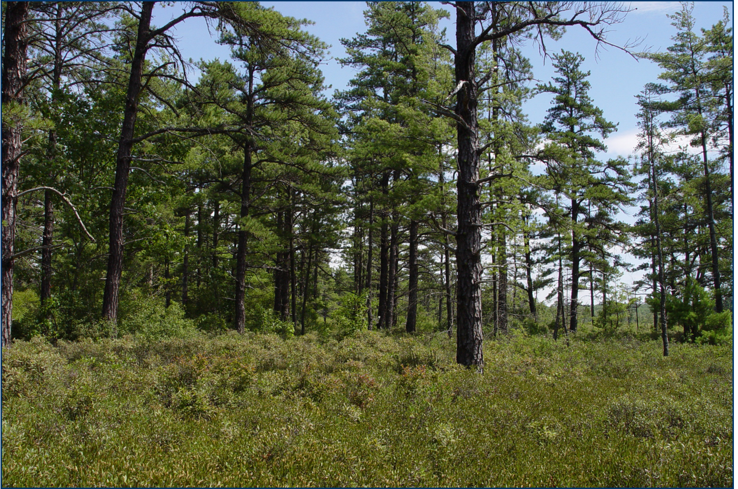
Pitch Pine Bog, Maine Natural Areas Program