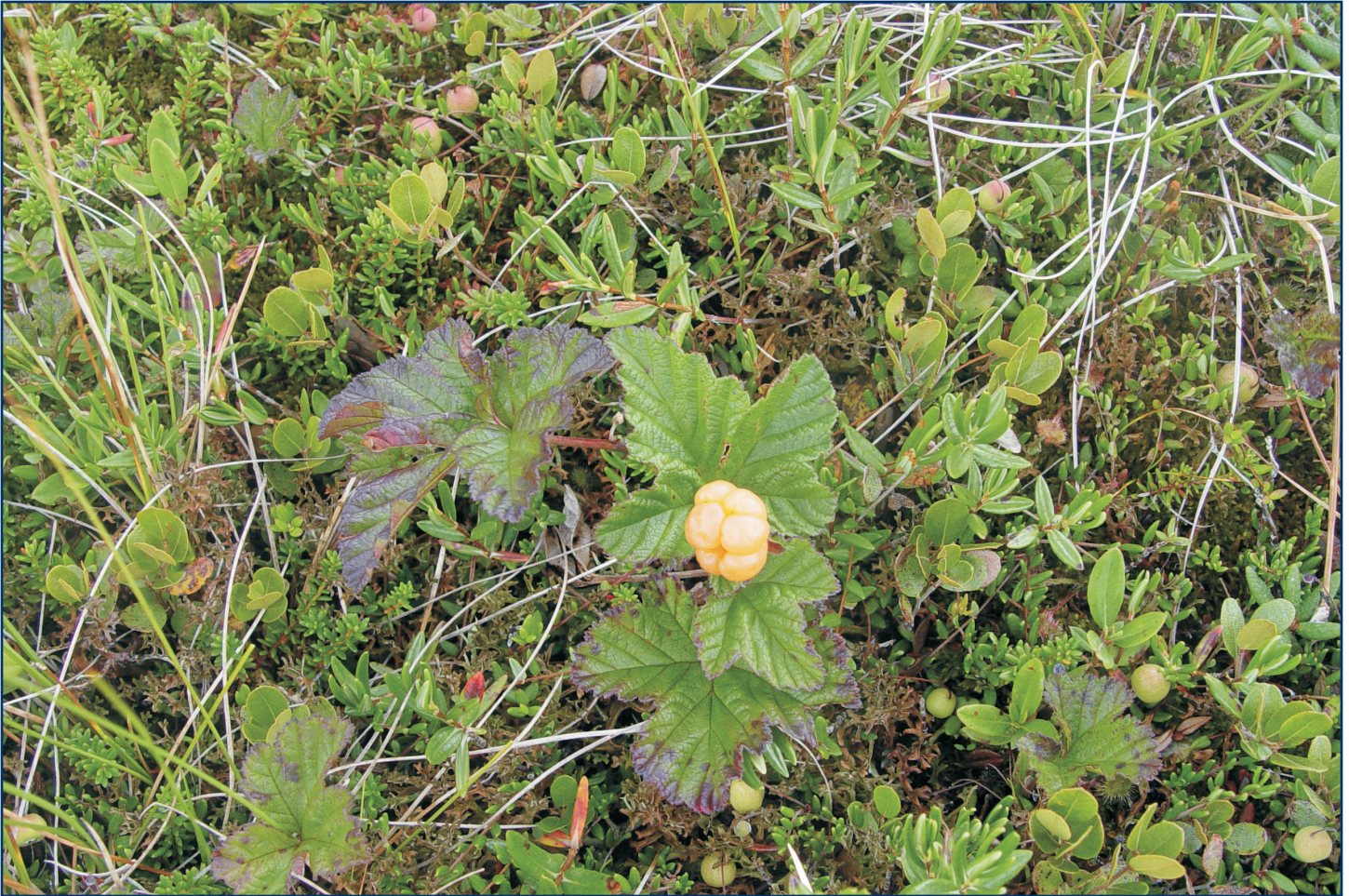
Baked apple-berry is abundant in the Coastal Plateau Bog Ecosystem found at Great Cranberry Island Heath, Maine Natural Areas Program