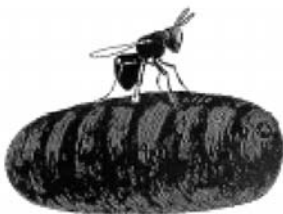
Parasitic wasp on fly pupa

Before using any chemical, always check with the Maine Board of Pesticide Control* to see if it is registered for use in this state and what regulations pertain to its use.